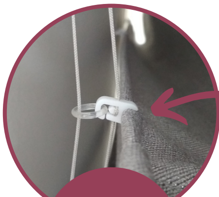
"SPECIAL CLIP SYSTEM AND DOUBLE CORD ON THE DRUM"

The wavy Roman blind is an excellent choice for those who appreciate a consistent, elegant decorative effect in their spaces without compromising on functionality and ease of use. It is a solution that combines the beauty of form with the practicality of application.