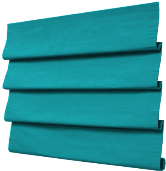
ROMAN BLIND "WAVY"

The wavy Roman blind is an excellent choice for those who appreciate a consistent, elegant decorative effect in their spaces without compromising on functionality and ease of use. It is a solution that combines the beauty of form with the practicality of application.